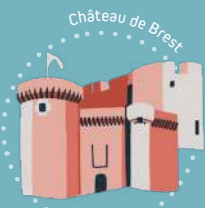
Château de Brest